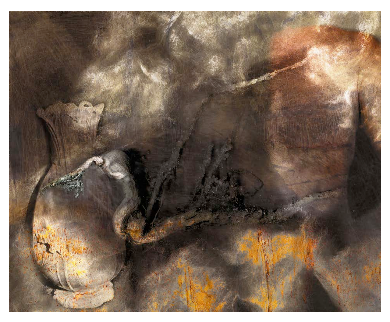
while I kick my heels and shout out in total fear, while we hurtle through your crags to where it's blacker: